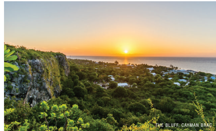
THE BLUFF, CAYMAN BRAC