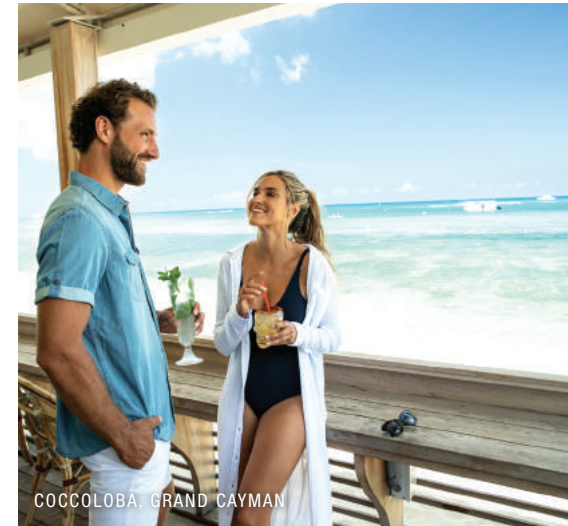
COCCOLOBA, GRAND CAYMAN

With exceptional culinary variety, unsurpassed ambience, and renowned local and international chefs, the Cayman Islands will inspire even the most discriminating gourmands.