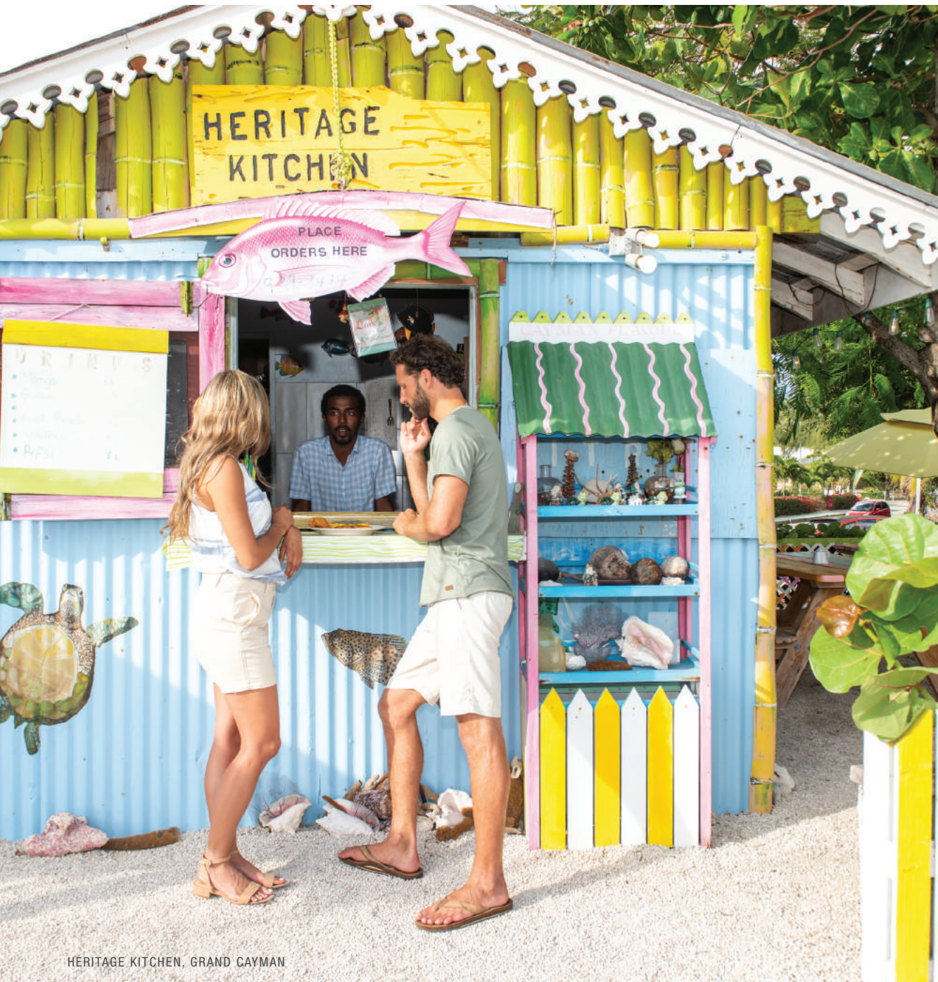
HERITAGE KITCHEN, GRAND CAYMAN