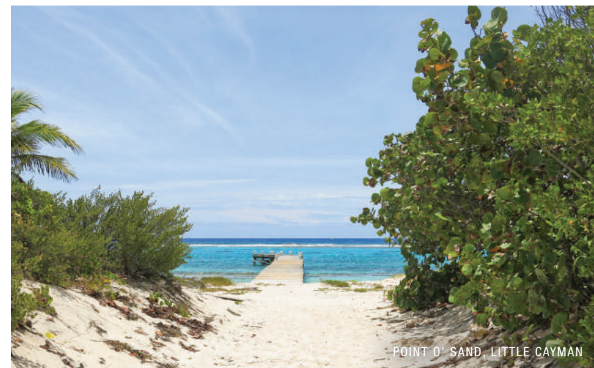
POINT O' SAND, LITTLE CAYMAN

GRAND CAYMAN The largest of our three islands, cosmopolitan Grand Cayman offers a wealth of activities, restaurants, accommodation and attractions. It is home to Cayman's most famous attraction, Stingray City.