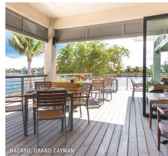
BACARO, GRAND CAYMAN