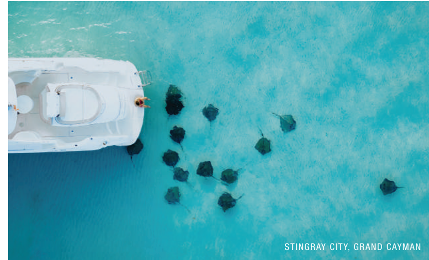
STINGRAY CITY, GRAND CAYMAN

Do it all. Or do nothing at all, except savour the spectacular view, the warmth of the people and the perfect weather. Either way, one thing is certain, your time in Cayman will be one you'll treasure forever. Three islands. Endless possibilities.