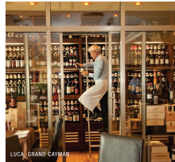
LUCA, GRAND CAYMAN